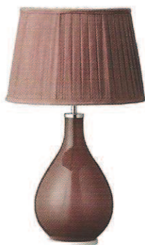
Glass lamp with velour shade (brown), 28 x 15cm base diameter, £319 , at Bloomingville