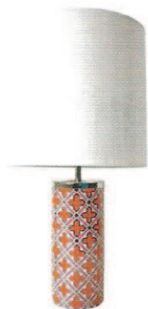
Glazed-porcelain 'Carnaby Talitha' with linen shade, 79 x 12.7cm base diameter, £295 , at Jonathan Adler