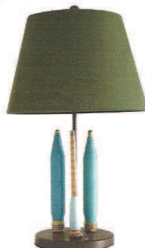
Brass with antique spools 'Turquoise Threads' with wallpaper-backed linen shade, 51 x 17cm base diameter, £1,693 , at LaLou