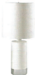
Ceramic white and silver-lustre 'Cada' with linen shade, 71 x 15cm base diameter, £99.81 , from West Elm