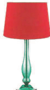
Glass 'Tamzin' (teal), 43 x 10cm base diameter, £29.99 , at Homebase, with cotton shade, 'Kivsta' (orange), £21.99 , at Ikea