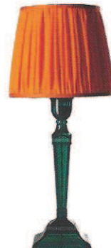
Acrylic with silk shade 'Bonaparte Lamp' (green), 46 x 11cm base diameter, £130 , from Mario Luca Giusti