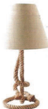
Abaca 'Riata' with jute shade, 67 x 24cm base diameter, £138 , at Anthropologie