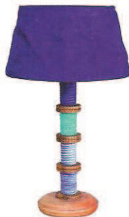
Wood and fabric lamp with reels, 41 x 14cm base diameter, £99 , from Chehoma